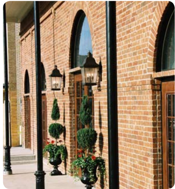
Figure 2.8.3 Doors are an integral part of a building's appearance and design

A. Original doors and door hardware shall be retained, repaired and refinished provided they can comply with ADA requirements. If new replacement doors are necessary, they shall be compatible with the traditional character and architectural design of the building.