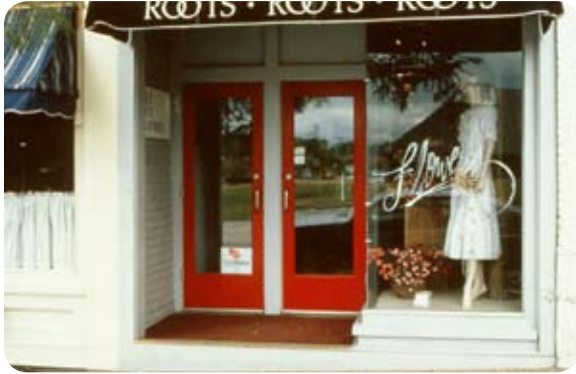
Figure 2.4.9 A red door color accent this entrance and invites consumers in