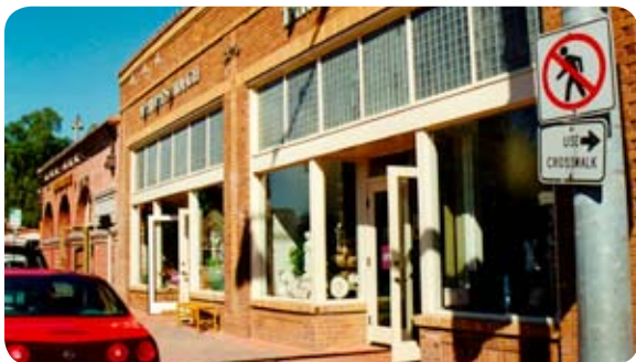
Figure 2.2.4 A steady rhythm of facade widths creates a uniform and pleasant streetfront

Rivertown buildings shall convey a scale appropriate for pedestrian activity. For the most part, this means two- to three-story development at the back of the sidewalk. These characteristics create a friendly atmosphere that respects the historic scale of the district while enhancing its marketability as a special commercial and residential area.