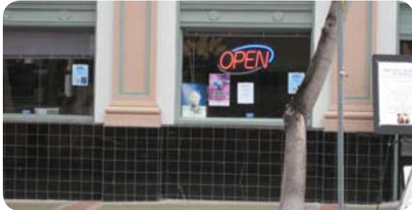
Figure 2.4.7 Tile used for bulkheads on the bottom of storefronts adds color and interest