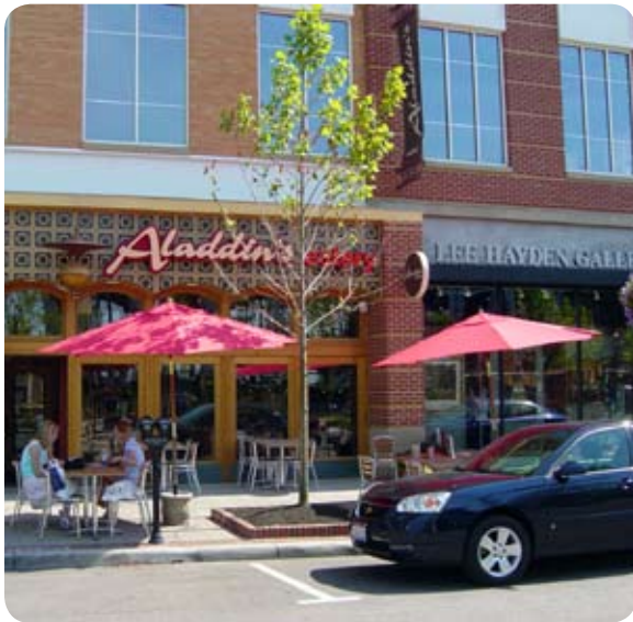
Figure 2.3.1 The Ground Floor of any new building shall be located near or along the front property line

A. The ground floor of any new building shall be located near or along the front property line, particularly on Second and G Streets. The front building facade shall be placed parallel to the street.