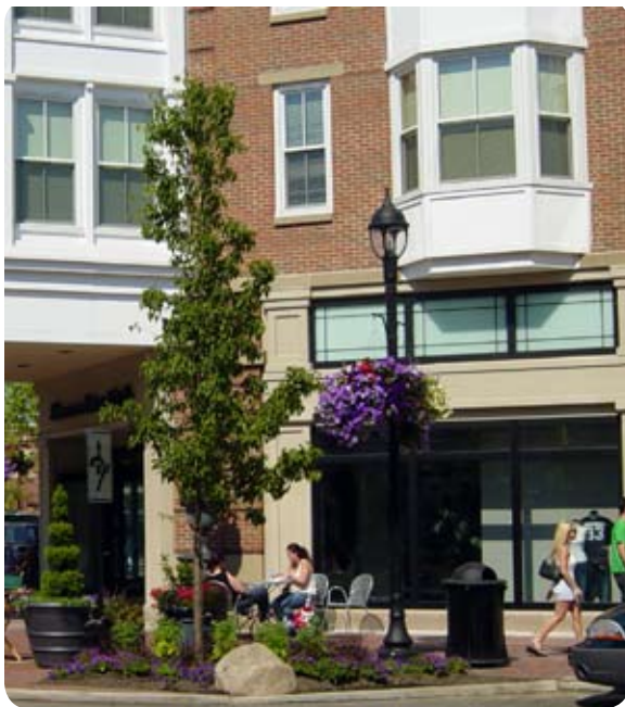
Figure 2.4.3 Bay windows provide vertical and horizontal articulation

D. Bay windows and balconies that provide usable and accessible outdoor space for upper floor residential uses are strongly encouraged and may slightly encroach over the public right-of-way.