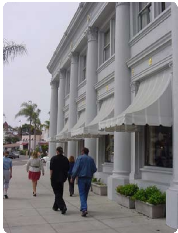
Figure 2.8.5 Paint can provide a fresh appearance for an older building's facade

B. Any necessary repairs shall be made to surfaces before painting (e.g., replace rotten wood, repoint masonry mortar joints, remove rust from metal).