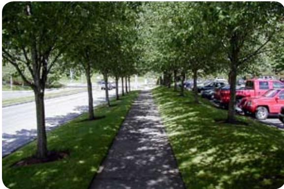
Figure 2.7.4 Landscape materials screen parking from the public right-of-way

B. Parking facilities adjacent to a public side street shall be landscaped to soften the visual impact of parked vehicles from the public right-of-way. Screening shall consist of a combination of low walls (a minimum of 3 feet high) and plant materials at the setback line.