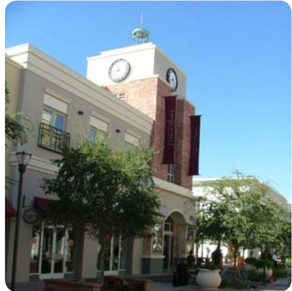
Figure 2.4.11 Vertical elements can be community focal points