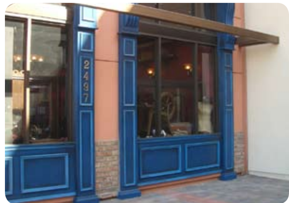
Figure 2.4.8 Using one vivid color as an accent provides interest without appearing busy