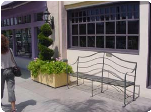
Figure 2.8.2 Original window openings add an air of authenticity to the building

A. Wherever possible, the original window openings shall be retained.