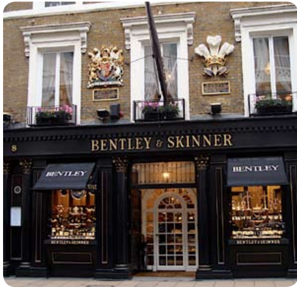
Figure 2.8.1 Storefront renovations complement the original design and materials for integrity

create a harmonious background that emphasizes them.