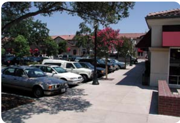
Figure 2.7.2 A raised sidewalk separates parking from the building providing safe pedestrian circulation

A. Parking areas shall be separated from buildings by a five foot minimum landscaped strip or raised concrete sidewalk. Conditions where parking stalls directly abut buildings shall be avoided.