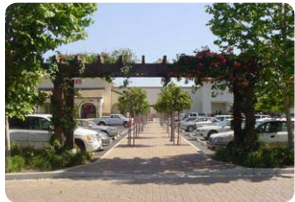
Figure 2.7.3 Pedestrian entrances are clearly identified to create a sense of arrival and provide a safe path of travel

D. Pedestrian and vehicular entrances shall be clearly identified and easily accessible to create a sense of arrival. The use of enhanced paving, landscaping, and special architectural features and details is required.