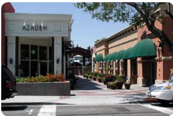
Figure 2.3.4 Mid-block paseos connect the street with parking, activities, or alleys

A. Storefronts and major building entries shall be oriented to key commercial streets as well as courtyards, plazas, and the waterfront. Minor side or rear entries may also be desirable on corner lots, courtyards, and plazas.