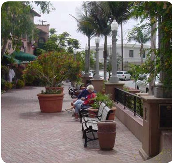
Figure 2.4.12 A plaza that contains ample seating

A. Ample seating in both shaded and sunny locations shall be provided in plaza and paseo areas.