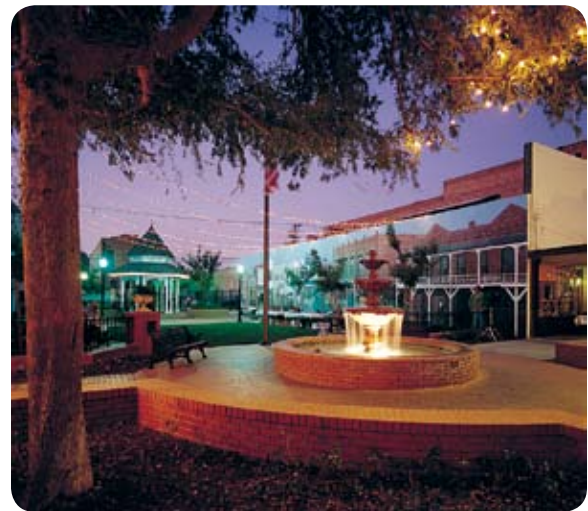
Figure 2.6.1 Night lighting of plazas and paseos can be used to create a comfortable ambiance

C. Specialty lighting in trees adjacent to or within outdoor patios and restaurants shall be used to create an inviting and festive atmosphere and encourage nighttime use by pedestrians.