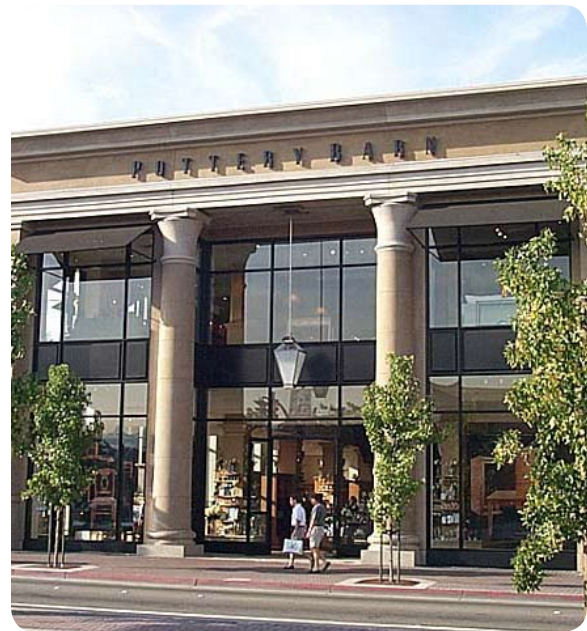
Figure 2.4.4 Columns help create structural bays to break up a long facade

F. Whenever a proposed infill building's facade is wider than the existing facades on the street, the infill facade shall be broken down into a series of appropriately proportioned "structural bays" or components, such as a series of columns or masonry piers, to frame window, door, and bulkhead components.