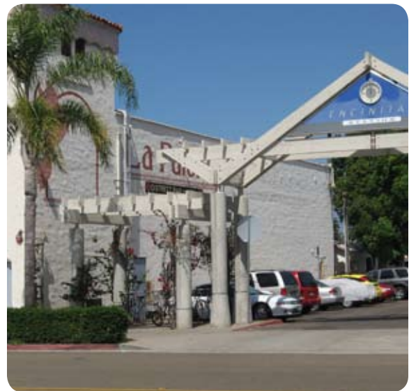
Figure 2.3.5 The rear of the building provides a good opportunity for parking in Rivertown

A. Parking lots shall be located to the rear of buildings or shared parking structures.