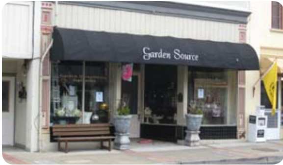
Figure 2.2.3 Traditional facade components such as display windows add visual interest to the pedestrian experience

bulkheads, arches, cornice/parapets, and balconies, are required.