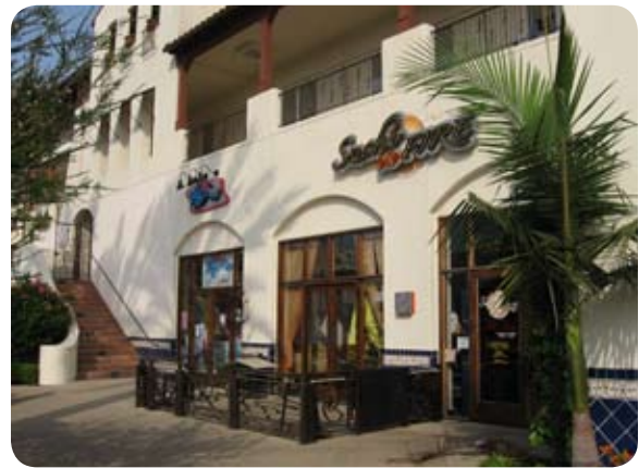
Figure 2.4.6 Stucco is effectively used in many architectural styles as an exterior wall material in Rivertown