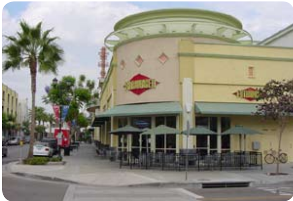
Figure 2.4.14 This building uses a logo rather than bright or intense colors to advertise the business