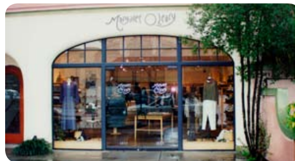
Figure 2.5.4 Storefront doors contain a high percentage of glass for displays to entice pedestrian interest