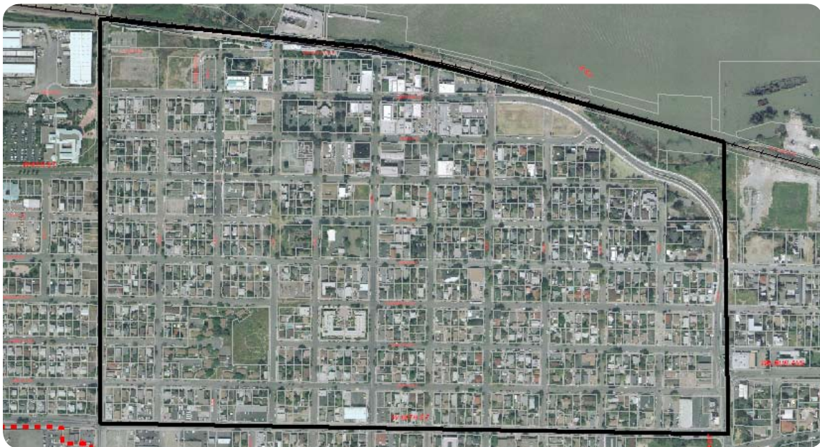
Figure 2.1.1 Rivertown

Antioch is home to a variety of historical resources ranging from landmark commercial buildings to Victorian, Craftsman, and modern style homes to churches, schools, and civic buildings. The Rivertown waterfront is still a distinctive resource containing numerous shipwrecks mapped offshore and many of the City's most historic buildings. Fifty-six Antioch buildings, four monuments and vanished sites are listed on national, state, local registers of historic properties and landmarks adding to the overall historical context of this dynamic waterfront city.