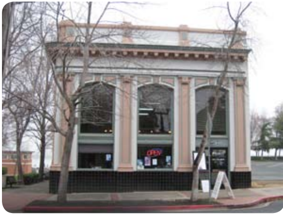
Figure 2.2.1 A Rivertown building with good design components

In order to create an inviting ambiance and preserve Rivertown's historic integrity, new infill development and renovation to existing structures must be respectful of the existing architectural context. Designs that are compatible and respectful of historic buildings in the area are encouraged. Some designs may use historic ornaments in new "revival" interpretations of older styles. These may be appropriate as long as the result is visually compatible with its surroundings and the design is distinguishable as new.