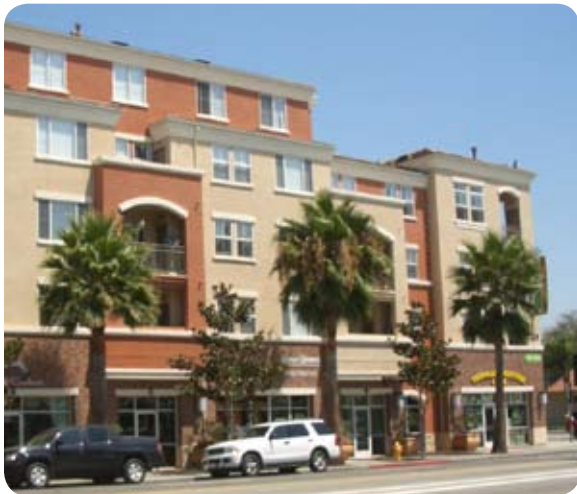
Figure 2.4.1 Vertical mixed-use structures use detailing on facades to create visual interest and reduce the overall sense of scale

A. Vertical mixed-use structures, with retail on lower floors and residential or non-retail commercial on upper floors, are encouraged within Rivertown (see additional guidelines for mixed-use development projects in Chapter 5, mixed-use design guidelines).