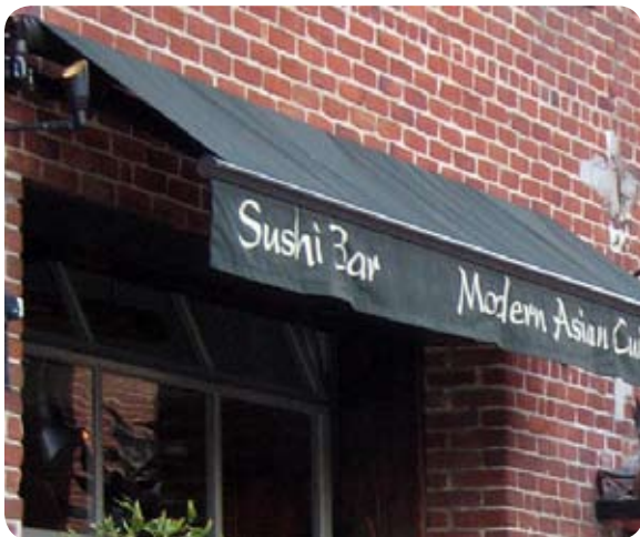
Figure 2.8.4 Canvas, slanted awnings are most appropriate for older storefronts

C. The traditional canvas, slanted awning is most appropriate for older storefronts and is encouraged, however contemporary hooped or box styles may be used if they are appropriate to the architectural style of the building.