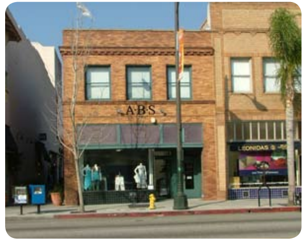
Figure 2.2.5 The upper floor facades exhibit more solid space than the ground floor facades

The ground floor facade of commercial buildings shall be predominantly transparent (clear windows), with a high ratio of void (windows) to solid (wall). This transparency helps to define the first floor as more open to the public. Upper floor facades typically have more solid space than the ground floor. Uniform storefront heights establish a line that helps to create a sense of scale for pedestrians. New Rivertown buildings should include the block's existing height elements and ratio of void to solid.