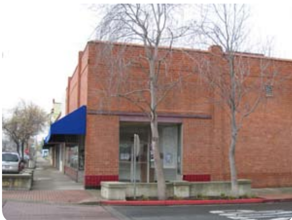
Figure 2.4.10 A typical flat roof commonly seen in Antioch