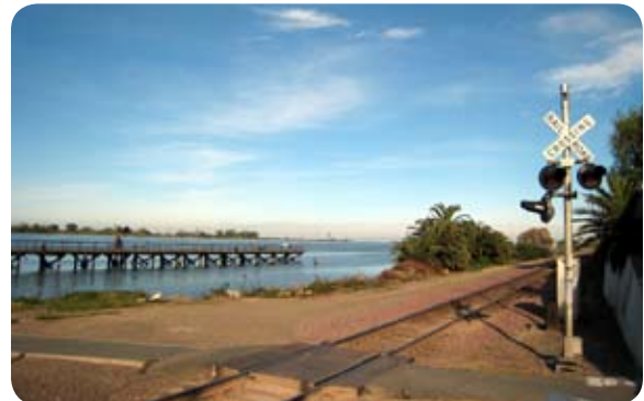
Figure 2.2.7 New development and renovated buildings shall promote physical and visual connection with the San Joaquin River