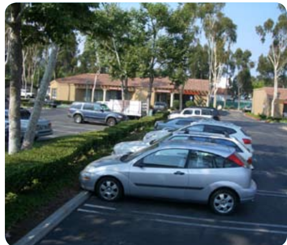
Figure 2.7.1 Trees provide valuable shade for Rivertown parking areas

D. Develop parking configurations that incorporate safe pedestrian circulation with a pleasant appearance through the use of canopy trees for shading, colorful accent plantings, and interesting hardscape elements;