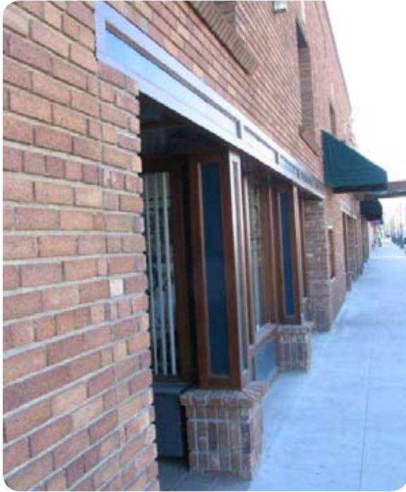
Figure 2.4.5 Minimizing the number of wall materials on a complex design enhances visual unity of design components

The complexity of building materials shall be based on the complexity of the building design. More complex materials shall be used on simpler building designs and vice versa. In all cases, storefront materials shall be consistent with the materials used on the proposed building and adjacent buildings.