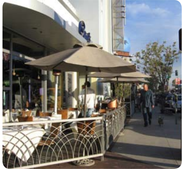
Figure 2.3.2 Front building setbacks shall accommodate active public uses such as outdoor dining

C. Additional setbacks shall be provided at public plaza areas.