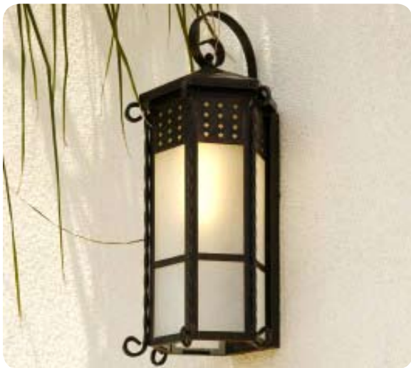
Figure 2.5.3 Light fixtures are an important storefront accessory for safety and as a design element