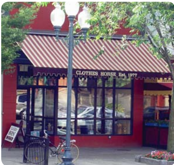
Figure 2.5.2 Awnings provide color and protection from the elements

Awnings provide excellent opportunities for color and visual relief as well as protection for buildings and pedestrians from the elements. They add pedestrian scale and visual interest to the storefront.