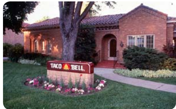
Figure 2.34.13 Brick is a natural material that can be used for franchise and corporate businesses