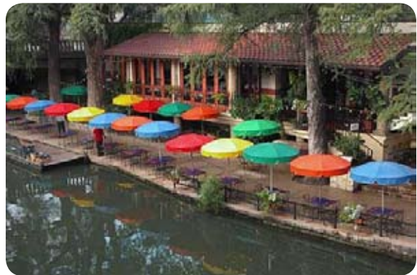
Figure 2.3.3 Restaurants situated along a riverfront offer an opportunity for unique atmosphere and dining experience

D. Buildings adjacent to or within view of the San Joaquin River shall be oriented to provide physical and/or visual connections to the river.