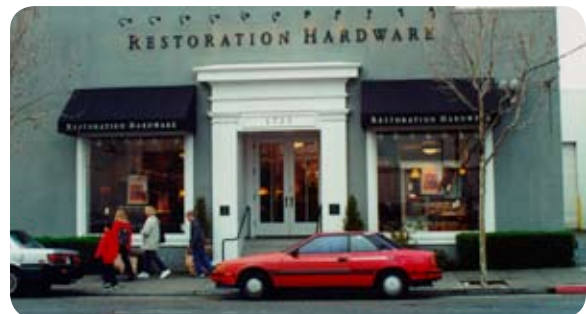
Figure 2.5.1 Flanked columns emphasize the recessed building entry