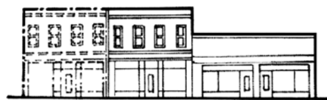
Figure 2.4.2 New construction should be similar to existing buildings in height, width and rhythm of openings

B. Building facades shall be detailed in such a way as to make them appear smaller in scale. This can be achieved through vertical and horizontal articulation such as: