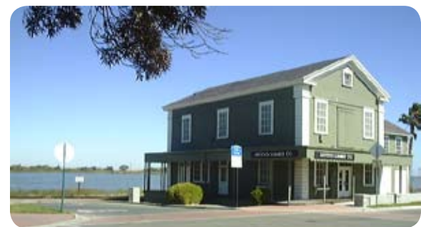
Figure 2.2.2 A successful blend of historic architecture and modern commerce